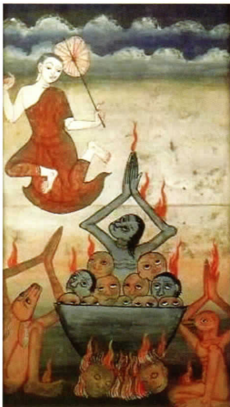
Left Maliyadeva ministering to beings in purgatory, Thailand, 19th century.