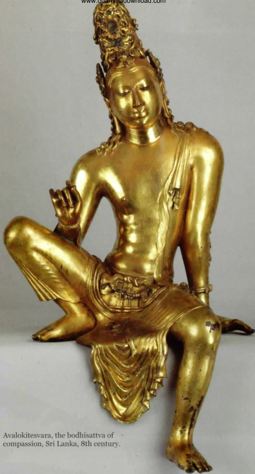
Avalokitesvara, the bodhisattva of compassion, Sri Lanka, 8th century.