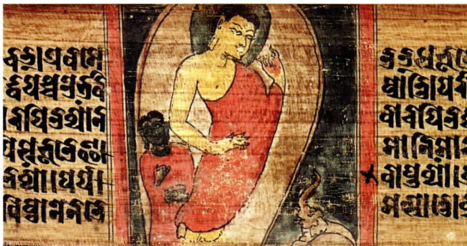
Below Palm leaf manuscript depicting the Buddha and Nalagiri, India 12th century