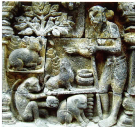
Above right Sasa Jataka, Indonesia, 10th century.