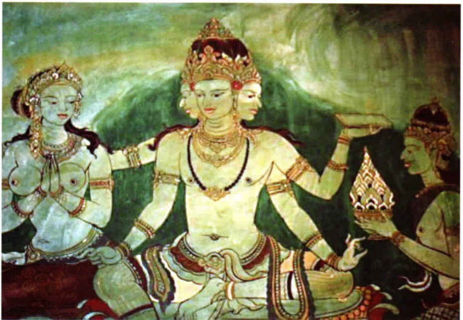
Below The four-faced four-armed god Brahma, Thailand, 20th century.