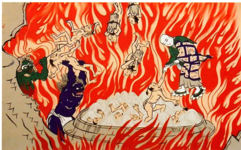
Below Ksitigarbha ministering to beings in purgatory, Japan, 20th century copy of 12th of century original.