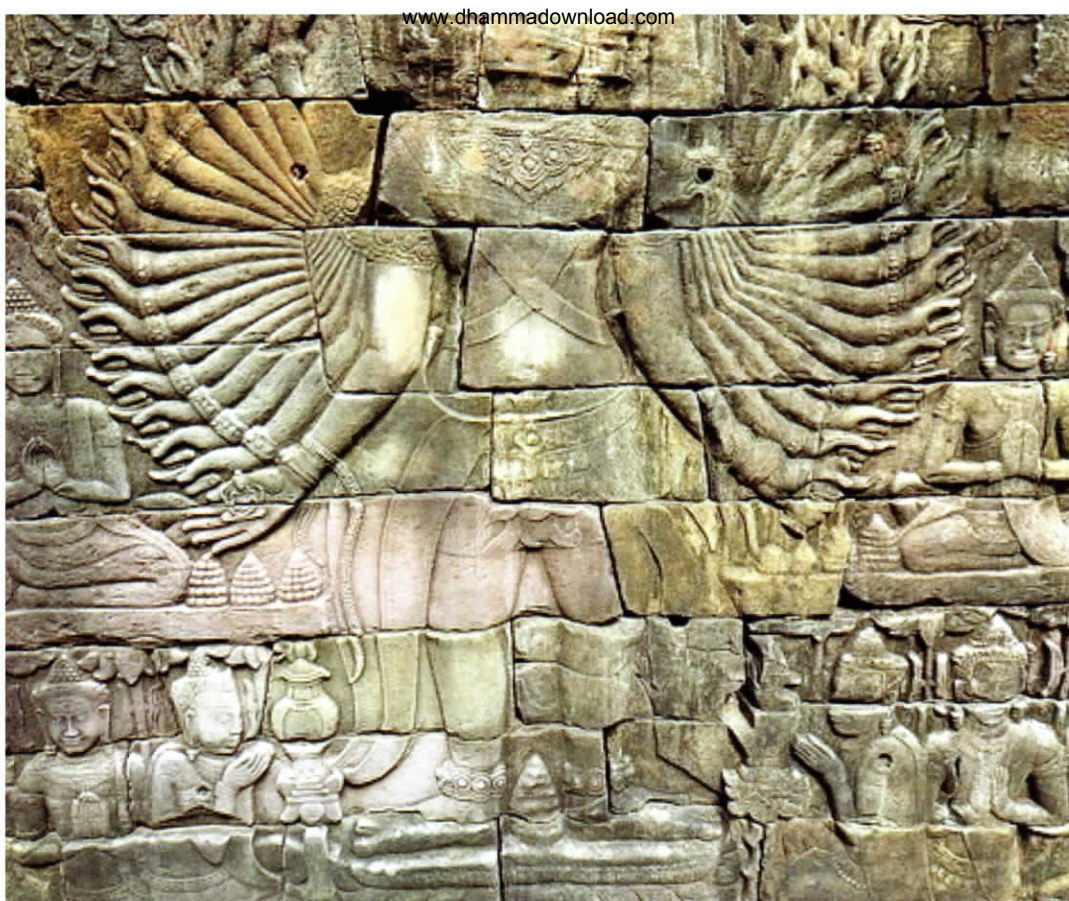
Above Avalokitesvara with a thousand arms, Cambodia, 12th century