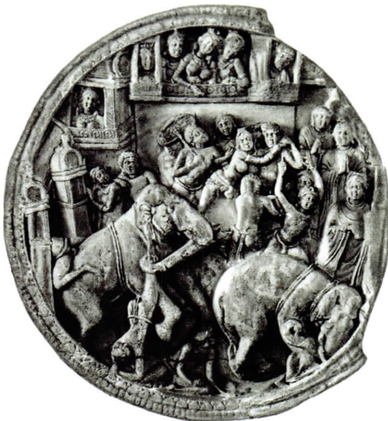
Above The Buddha suffusing Nalagiri with mettā, India, 150 CE.