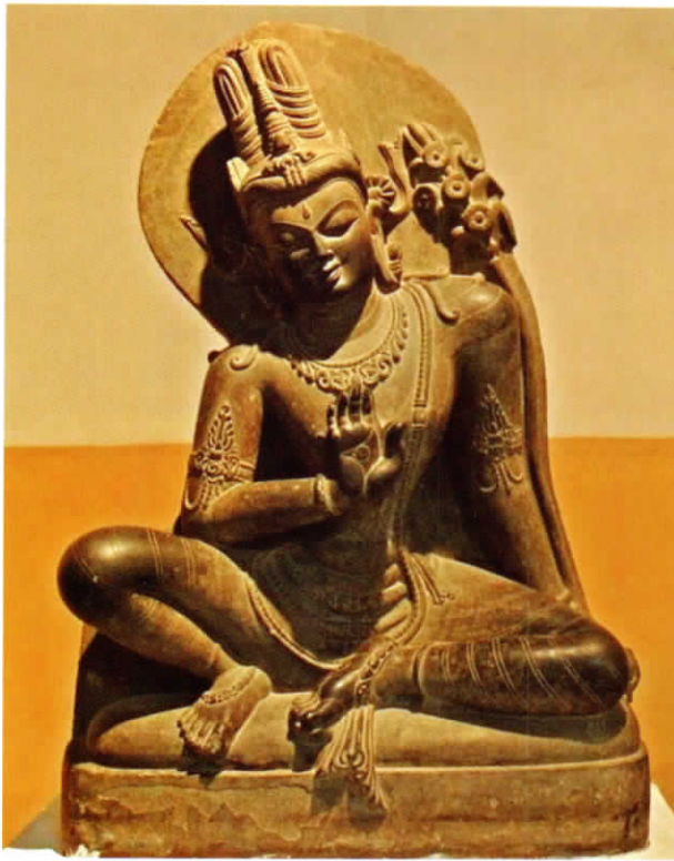
Left Metteyya, the future Buddha, India, 11th century.