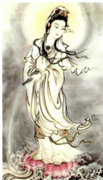
Left Avalokitesvara as a young woman, China, contemporary.