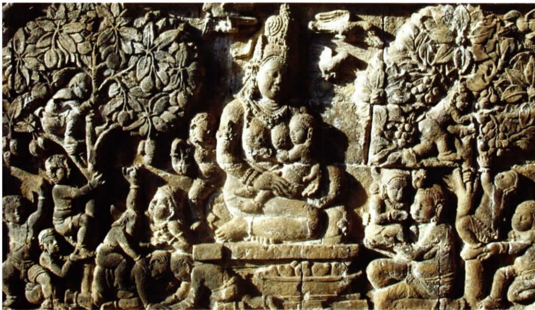
Below Hariti and her children, Indonesia 9th century.