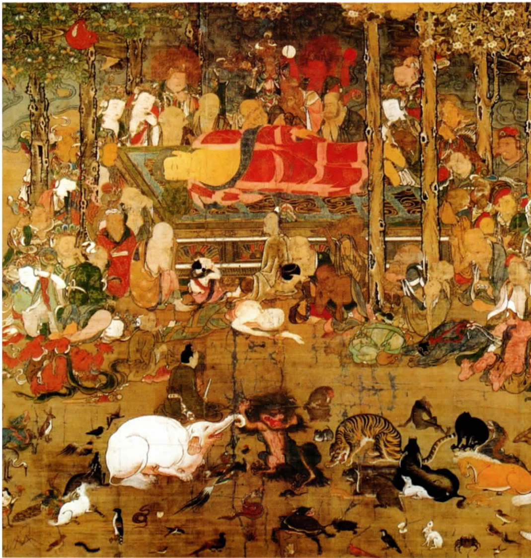
Animals mourning the Buddha's passing, Japan 14th century.